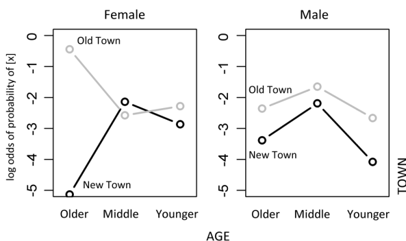
Figure 2: Plots of the 3-way interaction between TOWN, SEX and AGE for the fricative variable.

For the female speakers (the left plot in Figure 2), the pattern of the fricative variable shows clearly a converging trend. The older generation of Old Town residents, who are mostly Jin speakers, are significantly more likely to produce the [x] variants, whereas the older speakers from the migrant community are significantly less likely to produce this feature ( p < 0.001 ). This result also provides direct evidence for the frequent use of [p x , t x , k x , x] as a Jin feature, which supports the early linguists’ observation [7, 3]. When it comes to the second and third generations, speakers from the Old Town and