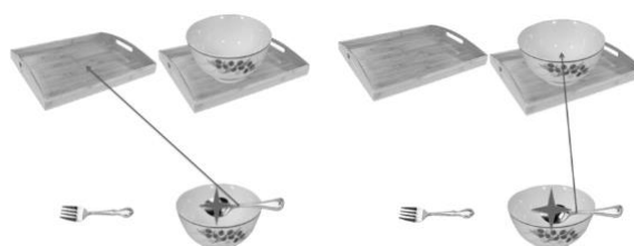
Figure 2: Schematic sample set of the target display for sentence “Put the spoon in the bowl on the tray” in Task 2.