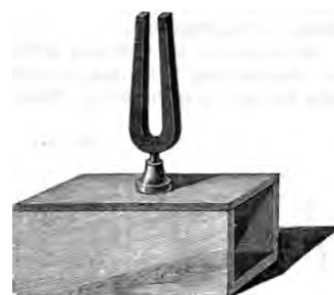
Figure 2: Tuning fork on the resonating box; illustration from Helmholtz's work [6].

Helmholtz gives an illustration of such a tuning fork in his treatise (although he also used forks without a resonating box) and complains [6, p.160] of the lack of high-pitched forks for the precise definition of [i]. He also deplors the fact that his tuning forks allowed measuring with a precision of one semitone only [6]. However, Helmholtz prefers