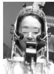
Figure 1: Helmet fixed on the head with camera mounted in front of the mouth, head-mounted microphone and US fixed under the chin.

Recording started by defining a rest position for the tongue, flat in the mouth, and for the lips slightly opened. Each word started from this rest position and ended the same way. This was to avoid confusion that might have occurred with bilabial consonants in initial or final position.