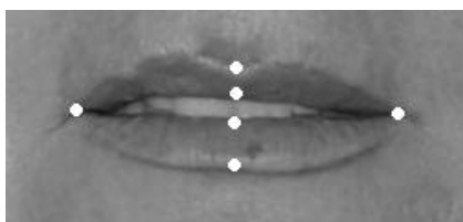
Figure 2: Picture of the lips at rest position taken with the video camera (60 fps), and the 6 points that served to determine on the vertical axis, the inner and external aperture, and on the horizontal axis, the stretching between the commissural of the lips.

Matlab program was built-up in order to allow for analysis. On every other frame, points were placed manually in 6 reference places (Fig 2) to measure the external and internal opening, and the stretching-rounding of the lips and euclidean distances were then calculated (in pixels) between these points. Each word was composed of about 70 to 100 frames.